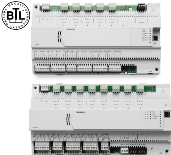
Figure 1. PXC Compact Series Controllers (PXC-24 and PXC-36 shown).