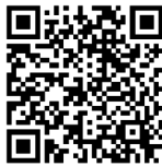
Figure B-1 EU Declaration of Conformity in SIOS

The EU Declaration of Conformity for the encoder is provided with the motor, and is additionally in SIOS ( https://support.industry.siemens.com/cs/ww/en/view/109756368 ), from where it can be downloaded.