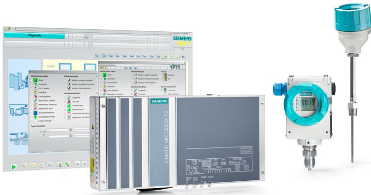
The SIMATIC PDM MS consists of a preinstalled industrial PC – the Microbox IPC 427E, as well as software and functional licenses