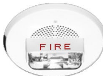
SEF-MC-CW Speaker Strobe