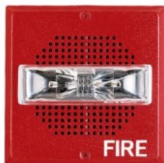
SEF-MC-R Speaker Strobe