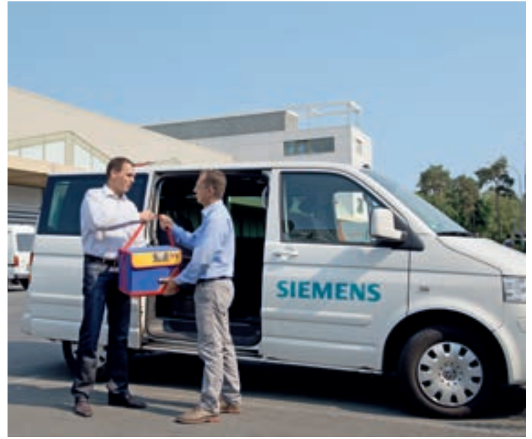
For an optimum supply solution

Services will develop and operate a supply solution tailored to your specific requirements.